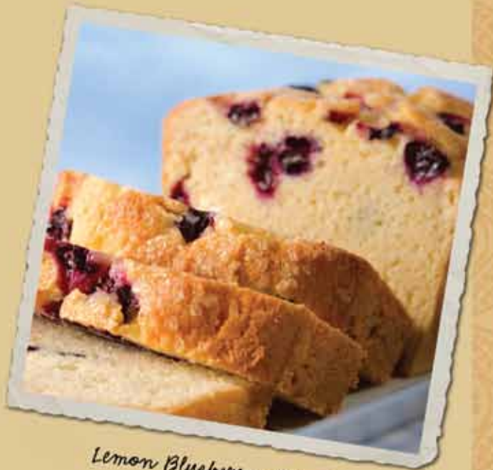
Lemon Blueberry Bread

For example, if you have a sandwich (one portion) with two slices (two servings) of Breadsmith 100% Whole Wheat, you accounted for two of your grain servings for the day. And when you're in the mood for something sweet, that Mini Cinnamon Bun is not only cute, but it is also a good way to not over-indulge.